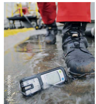
Dräger X-am 5000 Robust and water-tight