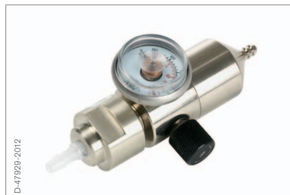
Pressure reducer For connection to the test gas cylinder.