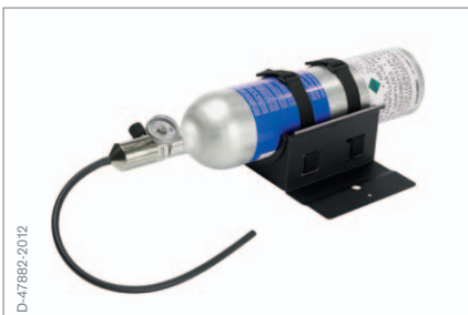
Test gas cylinder holder with test gas cylinder For securing the test gas cylinder to the X-dock Station.