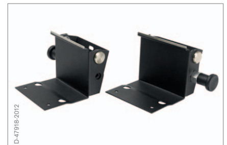
Wall mount Simple mounting option when fitted to a standard DIN rail.