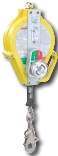
3504555 Ultra-Lok™ RSQ Self Retracting Lifeline