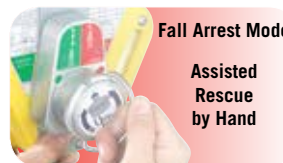
Fall Arrest Mode Assisted Rescue by Hand