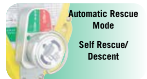
Automatic Rescue Mode Self Rescue/ Descent