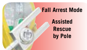
Fall Arrest Mode Assisted Rescue by Pole