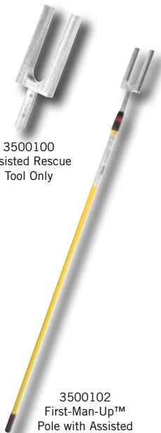
3500100 Assisted Rescue Tool Only