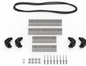
iM20XX-M4-BEZEL Base Bezel Kit (Metric)