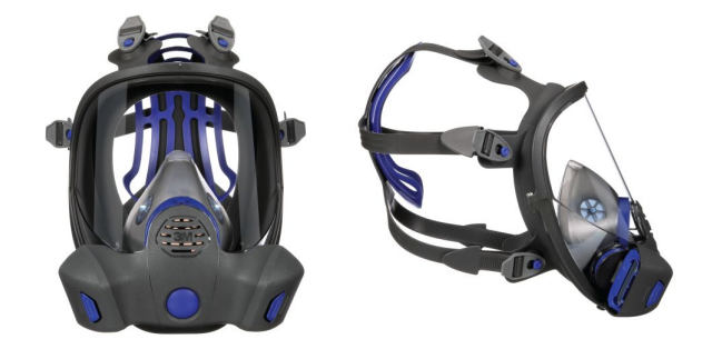
Figure 1: FF-800

All facepieces in the FF-800 range have the 3M™ Secure Click™ filter connection mechanism allowing connection to a broad range of 3M™ Secure Click™ filters to help protect against gases, vapours and/or particulates depending on your individual needs.