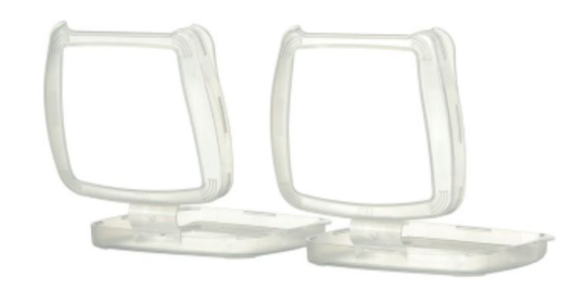
Figure 2: D701 Retainer