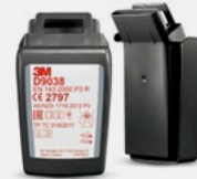
D9038 P3** Nuisance Organic Vapour & Acid Gas