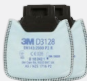
D3128 P2 Nuisance Organic Vapour & Acid Gas