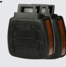
D8051 A1 D8055 A2 D8057 A1B1E1 D8059 A1B1E1K1