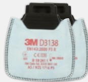
D3138 P3** Nuisance Organic Vapour & Acid Gas