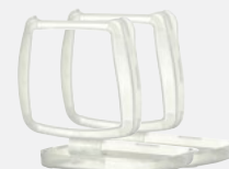
D701 Filter Retainer