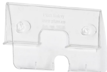
Plum QuickFix Solo®, transparent