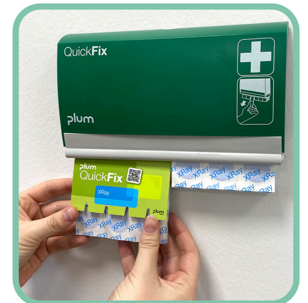
Push the refill pack into the dispenser until you hear a 'click'