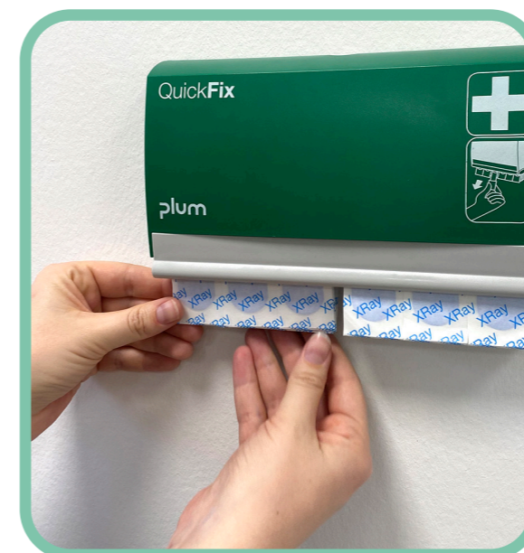
The plasters are now ready for use