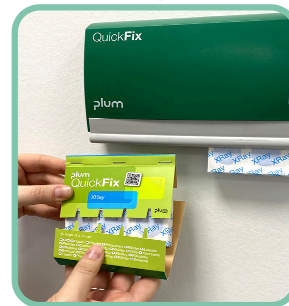
Remove the bottom part of the refill cardboard