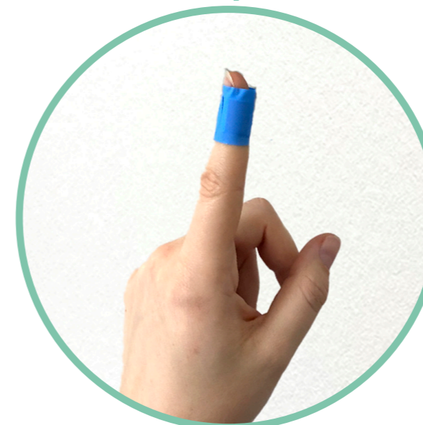
And back to work