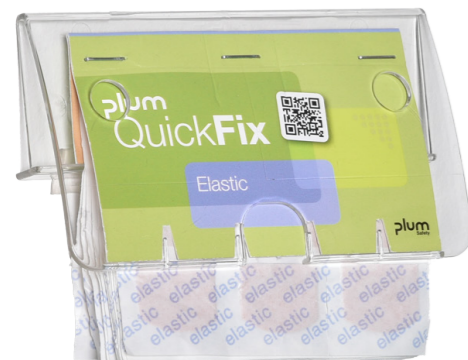
PLUM QUICKFIX SOLO® Transparent - shown with example of plaster refill

PLUM QUICKFIX UNO ELASTIC, WHITE White dispenser with 45 elastic and comfortable plasters that adjust to the movement of the skin. The plasters are skin-friendly and allow the skin to breathe. Article no: 5532 Packaging: 10