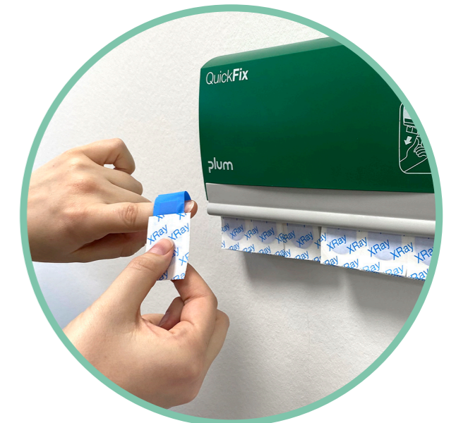
Put it on with one hand