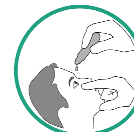
Step 2: Rinse the eye