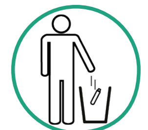
Step 3: Throw away the empty ampoule