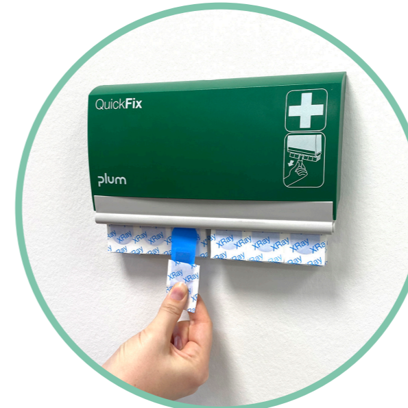
Grab a plaster