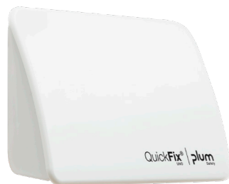
Plum QuickFix Uno, white