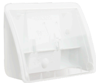
Plum QuickFix Uno, transparent